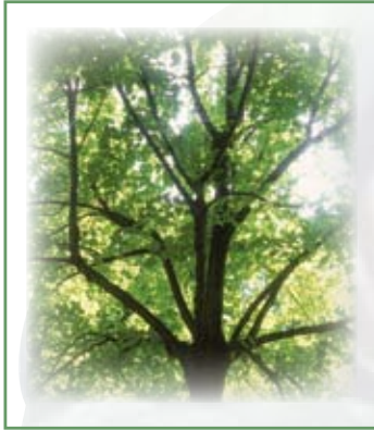
family and friends